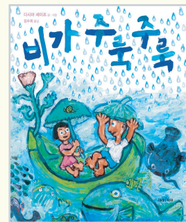
The Rain Is Dripping Down

3 times a day (Tue-Sun) 11:00 / 14:30 / 16:30